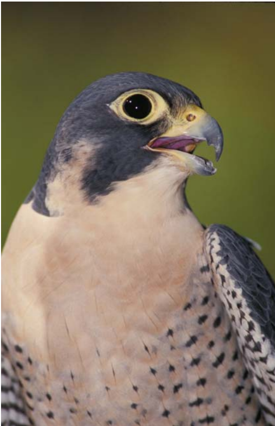
Peregrine falcons, which are State-endangered, nest on cliff faces and prey on other birds. They can dive at 200 miles/hour.

The majority of the WMA is located in southeast Cavendish and a small portion is located in the town of Baltimore. The Black River flows along part of the western boundary and a portion of the northern boundary. Cavendish Gulf Road parallels a portion of the southwest boundary. Access is limited and by foot only. From the south, the property can be accessed from the Cavendish Gulf Road by parking on the shoulder of the road and walking up and over a steep, rocky ridge. From the north, access may be gained by parking in one of several pull-offs along Route 131 and wading across the Black River.